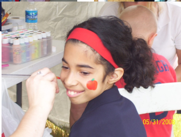
Face painting was a big hit, with the Orchard's "apple" appearing on the cheeks of several adventurous guests.