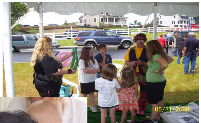
With ample tent area, a clown, balloon sculpture and face painting, not even intermittent showers could dampen or interrupt the enjoyment of those attending The Orchard's Grand Opening.